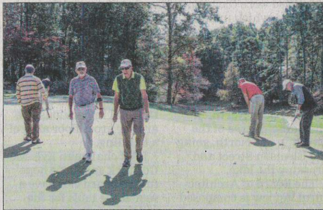
Some of the 120 golfers participating in the Sertoma Club golf tournament practice putting on Wednesday.

Proceeds from the event will go to provide at least 30 scholarships for